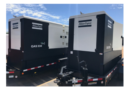
Portable & Standby Generators