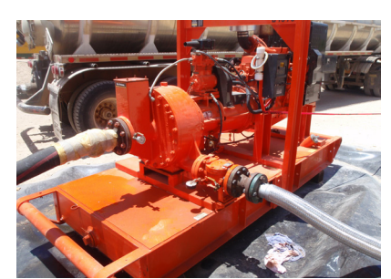
High Head Pumps for Temp Fire and Cleaning