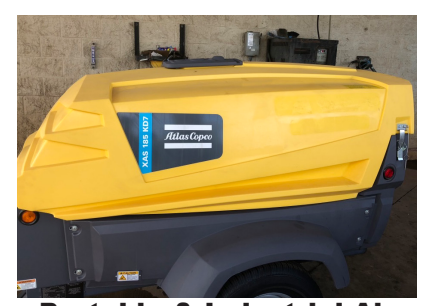
Portable & Industrial Air Compressors