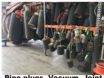
Pipe plugs, Vacuum, Joint & Mandrel Testers